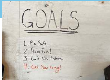
Boatshed sign 2022